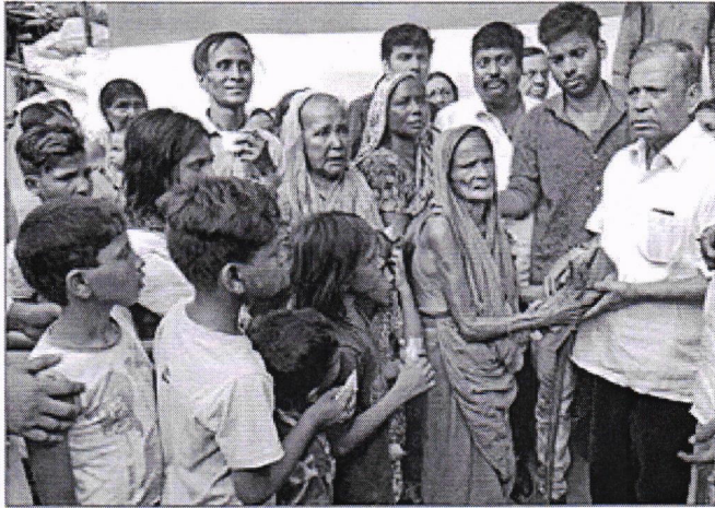
ইস্ট ক্যান্টন বিদ্যালয় পাঠশালায় ছাত্রদের। ছাত্রদেরা, ছাত্রদেরা, ছাত্রদেরা

কলকাতার একটি প্রতারণা কেসের প্রতারণা পাকড়াও করা হয়েছে।